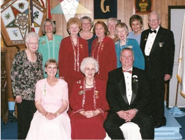
Most Worthy Grand Matron (front - center) and Traveling Party

It was also an opportunity to share our beautiful state with all of them...and that we did. They began their Alaskan adventure in Juneau, explored Soldotna, Palmer, Fairbanks and spent a few busy days in Anchorage.